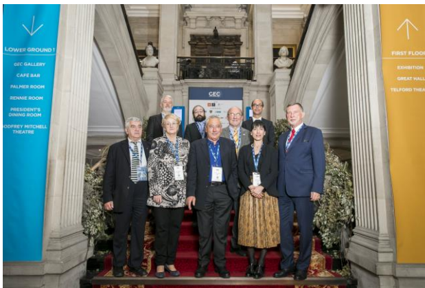
New ECCE ExBo 2018-2021

The General Assembly of the European Council of Civil Engineers (ECCE) has elected a new Executive Board at the ECCE Executive Board Elections that took place on 23 rd October 2018 at the 68 th ECCE General Meeting in London, U.K.